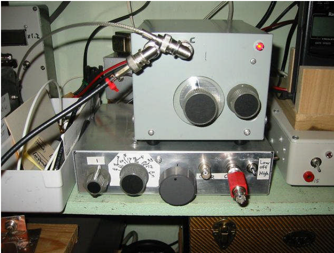
Fig 2. The upper gray box is an exterior view of the 8640-Jr. The lower box with three knobs is the RF source of fig 7.27, p 7.15 of Experimental Methods in RF Design (ARRL, 2003.)

Photos of the rf source are shown below.